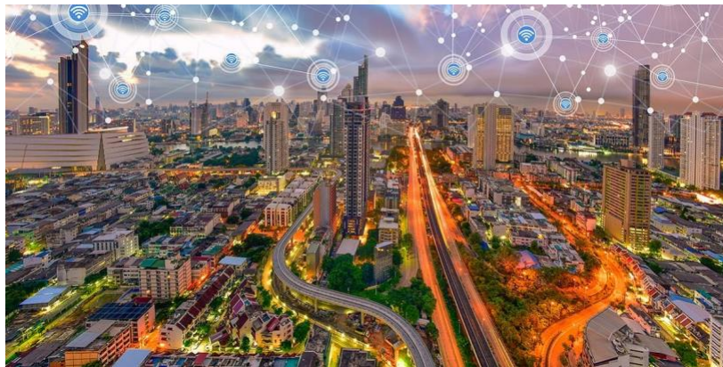
Figure 3: Smart City [1]

In conclusion, smart cities represent a paradigm shift from conventional urban management to data-driven, citizen-centric governance. By adopting smart infrastructure, cities aim to achieve economic competitiveness, environmental sustainability, and social inclusiveness, thereby creating urban environments that are both liveable and future-ready.