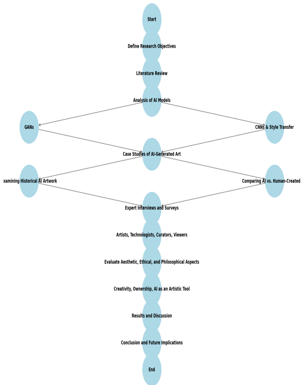
Figure 2: Research Methodology for AI in visual Arts