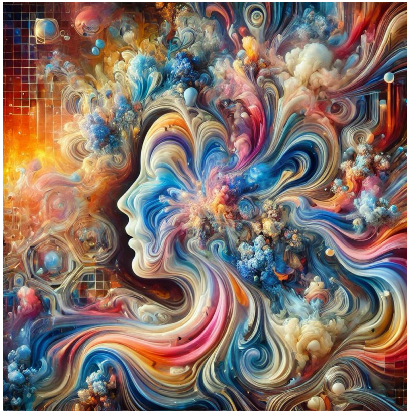
Figure 1: AI-Generated Artwork Using GANs

The following image illustrate some of the capabilities of AI-generated art: